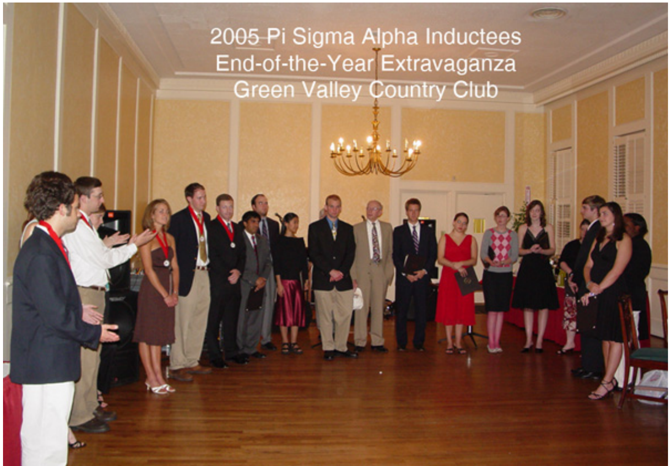
Furman University Pi Sigma Alpha Initiation and Awards Banquet, 2005.