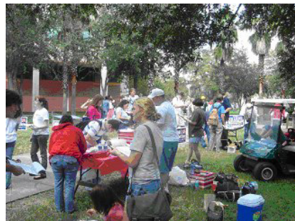
University of South Florida presidential straw poll co-sponsored by Zeta Pi Chapter and USF Student Government Association.