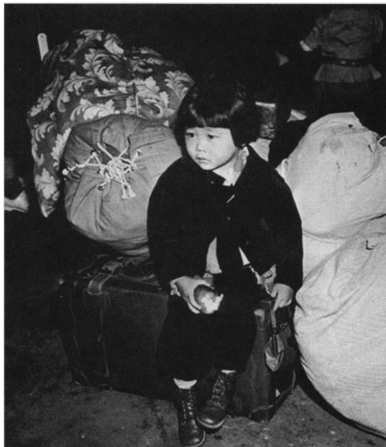
Facing History. Over 120,000 Japanese Americans—two-thirds of whom were U.S. citizens—were interned during World War II.

politics in their native countries, but in recent years there has been more involvement in American politics. This demonstrates a classic pattern followed by many immigrant groups who join together to defend ethnic enclaves. Faced with hostility or other American problems, South